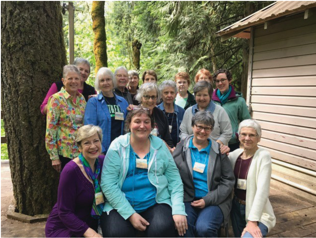
Eve's Circle "Desert Mothers" Retreat at Camp Adams on May 20, 2017