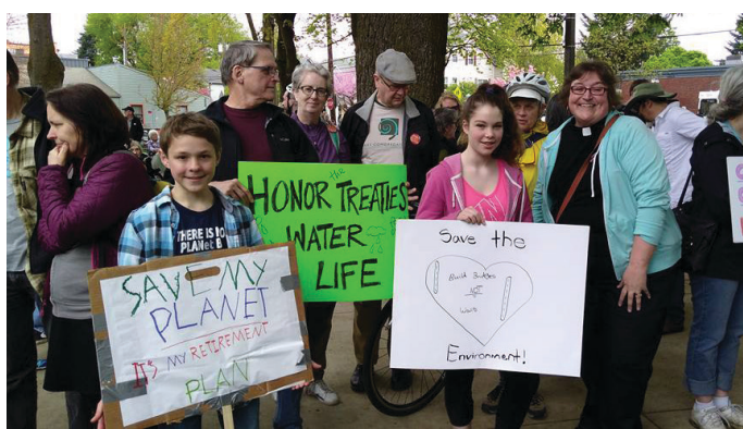
First Congregational youth and adults joined thousands of others in advocating for climate justice at the People's Climate March in North Portland on April 29, 2017.