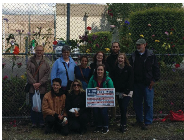
First Congregational youth and adults rallied for an end to deportations at the 9th Annual Mother's Day Vigil at the Northwest Detention Center in Tacoma, Washington on May 13, 2017.

This has been a busy Spring for our children and youth! Our children enjoyed a festive palm-waving processional on Palm Sunday, a lively egg hunt on Easter, and helped to wave fiery "Spirit" banners, pass out "tongues of fire," read the scripture and serve communion on Pentecost. We continued our Godly Play Spring series on "Knowing Jesus in New Ways" and welcomed two new teachers and two new doorkeepers at our Godly Play training in early May.