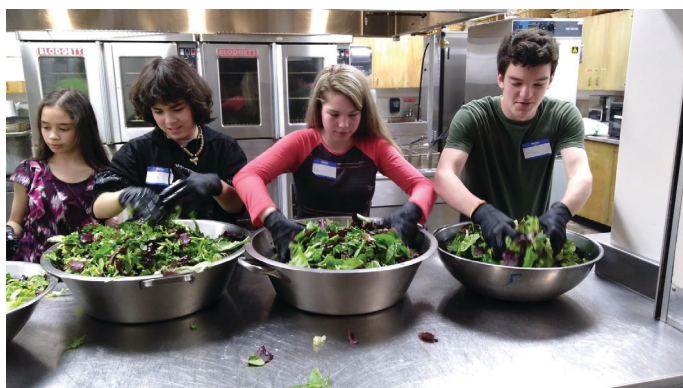
Preparing salad for attendees at the "We Refuse To Be Enemies" interfaith event at Neveh Shalom synagogue on May 21, 2017

"Peace I leave with you; my peace I give you. I do not give to you as the world gives. Do not let your hearts be troubled and do not be afraid." – John 14:27