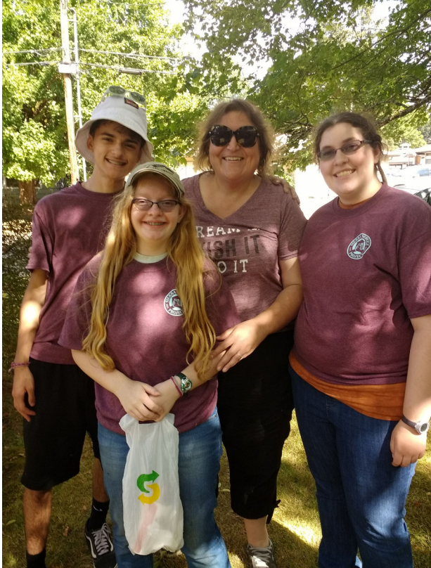
Sierra Service Project