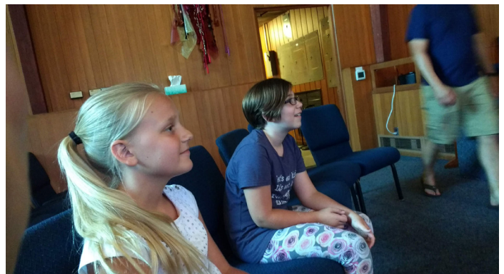
Fun in Hawaii!