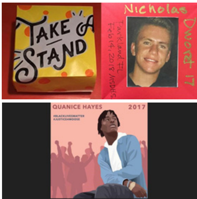
Examples of finished SoulBoxes