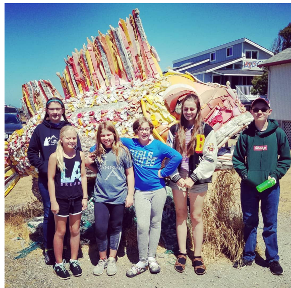
Youth Group in Bandon, Oregon