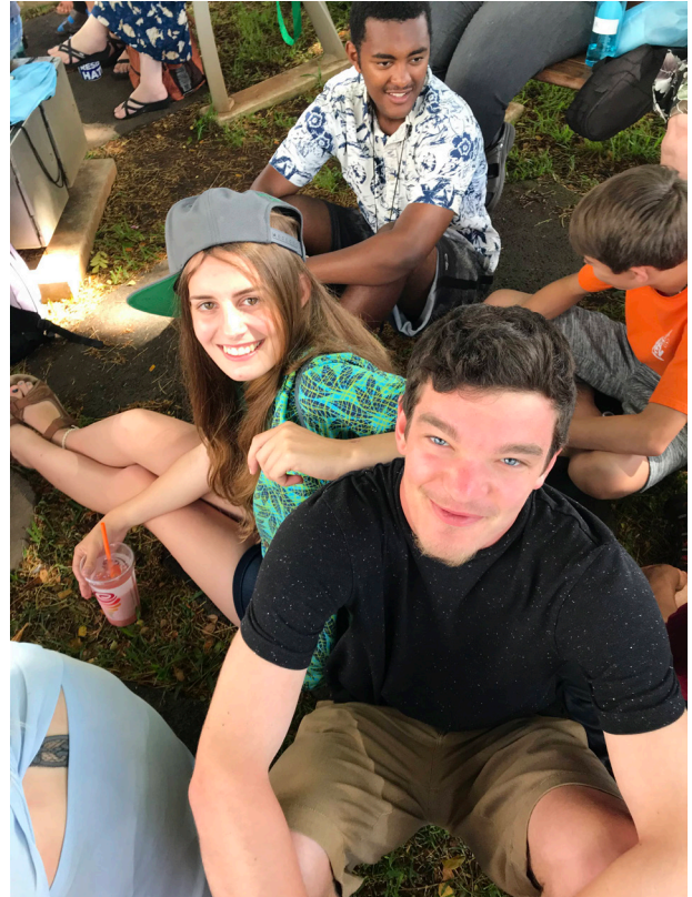
More fun in Hawaii!